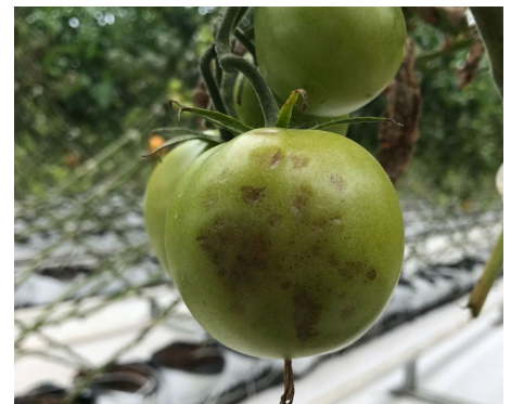
Symptomatic tomato leaves

To learn more about ToBRFV and our efforts to safeguard against its introduction into the United States, please visit: https://www.aphis.usda.gov/planthealth/tobrfv .