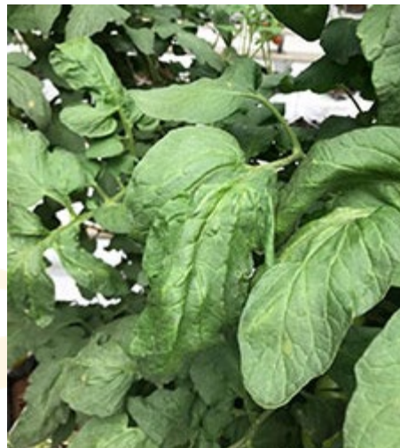
Symptomatic tomato leaves

Once the virus is introduced in an area, control measures mainly rely on elimination of infected plants and the use of strict sanitation measures. We urge U.S. tomato and pepper producers, the nursery transplant industry, and the seed industry to follow necessary sanitation practices to safeguard against the introduction of this virus into the production environment and to report any signs of symptoms to their State Plant Regulatory Official.