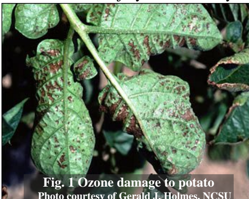
Fig. 1 Ozone damage to potato

Symptoms: Ozone: Ozone is considered the most damaging phytotoxic air pollutant in North America. Injury is most likely during hot, humid weather with stagnant air masses.