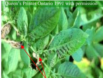
Fig. 3 One side of stem with severe O 3 damage Symptoms of ozone damage can appear on one side of a plant or stem depending on the source of pollution and micro-climate (Fig. 3).

Symptoms on one cultivar can differ from the symptoms on another. With continuing ozone exposure the symptoms of stippling, flecking, bronzing, and reddening are gradually replaced with chlorosis and necrosis (Figs. 2d and e). Early ozone foliar damage (Figs. 2b and c) can resemble severe spider mite injury. The presence of mites can be confirmed by examining the underside of the leaf. Mite populations would have to be comparatively great ( \geq 45 /leaf) to cause the type of leaf injury shown in Figs. 1b and c.