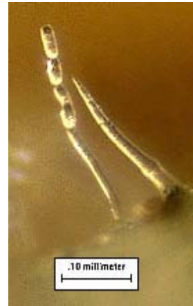
Fig. 2. Erysiphe orontii conidiophore with four conidia, adjacent to plant trichome, viewed with stereomicroscopy.