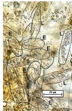
Fig. 4. Short-cylindrical to ovoid conidia of Erysiphe orontii (E), and cylindrical and lanceolate conidia of Leveillula taurica (L) viewed with brightfield microscopy.

Discovery of the two species sporulating together on diseased leaves is consistent with the similar observation made in the Middle East (2). The preponderance of E. orontii conidiophores and conidia tended to obscure the presence of L. taurica . It is possible that L. taurica has been overlooked in the past because its presence was masked by profuse sporulation of E. orontii . Easton and Nagle (3) noted that although application of sulfur dust or liquid for control of potato powdery mildew generally was successful, the applications sometimes failed to prevent development of severe symptoms. One possible explanation for variable effectiveness of fungicide treatments is that L. taurica and E. orontii might differ in their sensitivity to fungicides. Further research is warranted to assess the co-occurrence of L. taurica and E. orontii on potato crops in North America, the factors governing co-infection, and whether responses to foliar fungicide applications by the two pathogens are similar.