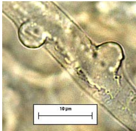
Fig. 1. Erysiphe orontii appressoria viewed with brightfield microscopy.